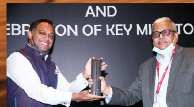
Only Indian supplier to receive two Boeing Supplier of the year Awards within 5 years, in 2015 and 2019