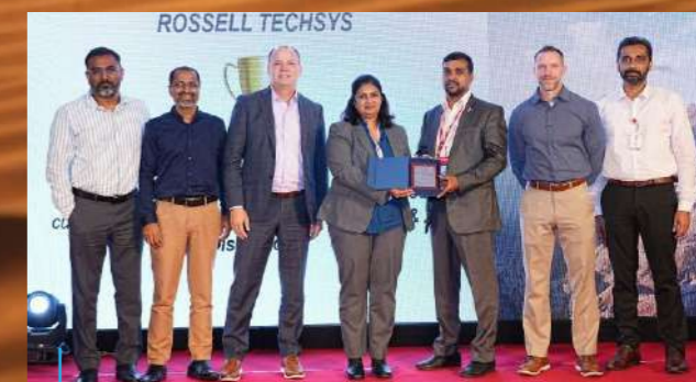
Rosell Techsys received the "Supplier Excellence Award" for Quality Performance at the Honeywell Supplier Conference in Bangalore.

The company has been repeatedly recognised by its global partners. One of the leading global companies honoured Rosell Techsys with the prestigious "Supplier of the Year" award in 2015 and again in 2019—making it the first Indian A&D company to receive the distinction twice in five years. Additional awards have followed from industry bodies, including the Vertical Flight Society (formerly American Helicopter Society).